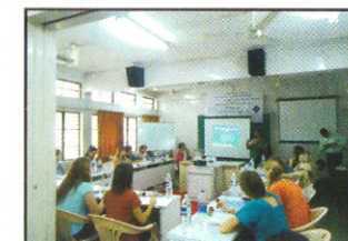
Seminar Hall- I