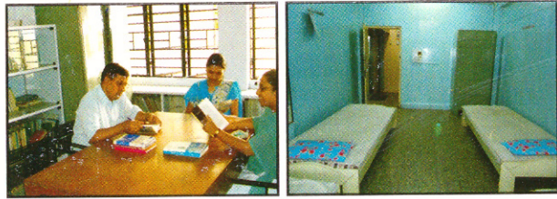
Library & Documentation Centre Accommodation Facilities