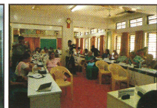
Seminar Hall- II