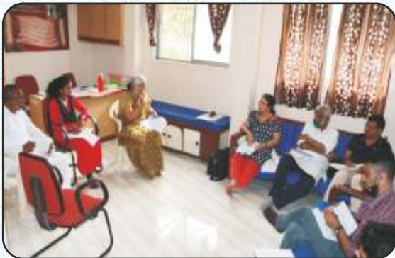
CAH Project Review Meeting at DISHA Kendra Block Karjat District Raigad on 9/1/2021