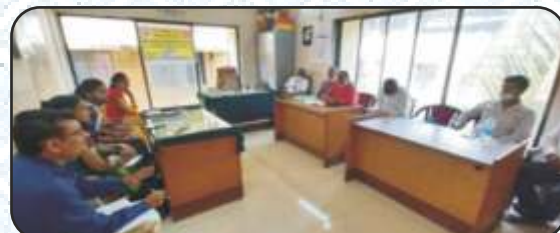
District Level Meeting at Panchyat Samiti Alibaug District Raigad on 10/3/2021

District Infectious Disease Control Officer District Gadchiroli ; District RCH Officer District Gadchiroli; HWC District Coordinator District Gadchiroli; District Program Manager District Gadchiroli; District RKS Co-Ordinator District Gadchiroli; Block Health Officer Block and District Gadchiroli; Block Health Officer Armori District Gadchiroli; Block Health Officer Kurkheda District Gadchiroli; District Coordinator Ahmi Amchya Arogya Sathi District Gadchiroli; Coordinator Ahmi Amchya Arogya Sathi District Gadchiroli; District Supervisor CAH Project Gadchiroli; Block Coordinator Gadchiroli CAH Project; Block Coordinator Armori CAH Project; Block Coordinator Kurkheda CAH Project