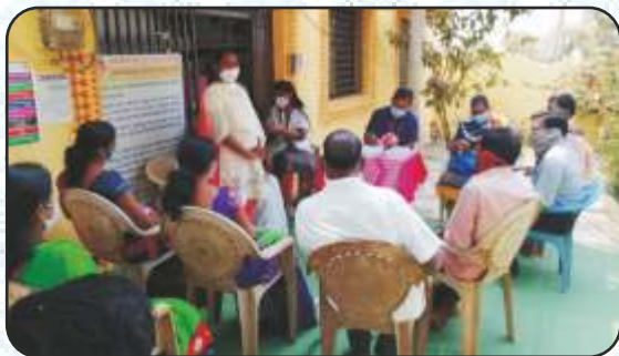
Visit of Block Health Officials at Dogargaon Sub Centre Block and District Gadchiroli on 9/3/2021