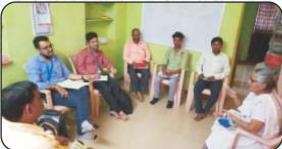
State Nodal NGO Project Team STAPI and Nandurbar District Project Team during Project Review Meeting at Janarth Adivasi Vikas Sanstha Block and District Nandurbar on 17/2/2021