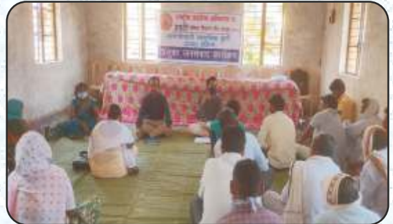
JIVATI Block JANSAMVAD District Chandrapur on 25/3/2021