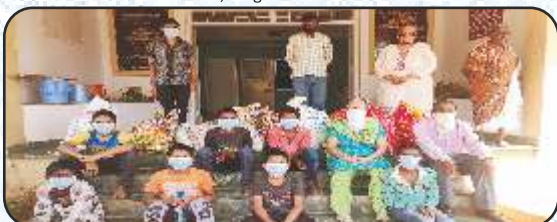
Distribution of Food Grains/Dry Ration and Medical Accessories to Janseva Foundation Balsadan Katraj District Pune 23/05/2020