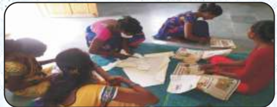
Six Women from Mahalaxmi SHG in mask stitching training on 9/3/2021