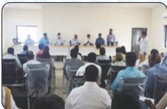
BISLD Participation in District Collector meeting on at Palghar for brief about CAH project on 12/1/2021