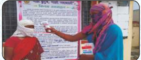
Adherence of "My Family My Responsibility" during COVID-19 Pandemic Self Help Group at Samtanager, Village Tardobachiwadi, Block Shirur, District Pune