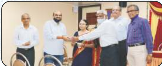
CAH Project kick off Meeting at Maharashtra Seva Sangh Mulund Mumbai, on 7/1/2021