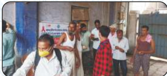
Advocacy Meeting at Gautam Compound Apsara Hotel on 10/08/2020