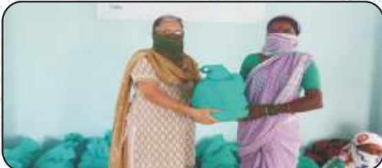
Distribution of Dry ration at Samtanager, Village Tardobachiwadi, Block Shirur, District Pune