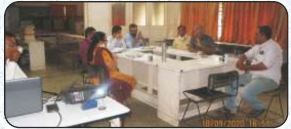
STAPI Team during the aftercare programme support service for young adult orphans discussions with the Officials of Maharashtra State Probation and Aftercare Association at STAPI on 18/9/2020