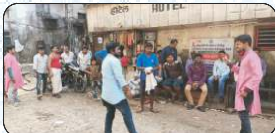
Street Play at Phena Pada, Bhiwandi on 11/11/2020