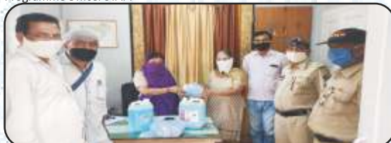
Distribution of Medical Accessories to Open Jail Yerwada on 22/05/2020