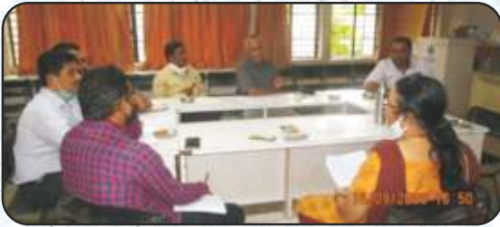
STAPI Team during the after care programme support service for young adult orphans discussions with the Officials of Maharashtra State Probation and Aftercare Association at STAPI on 18/9/2020