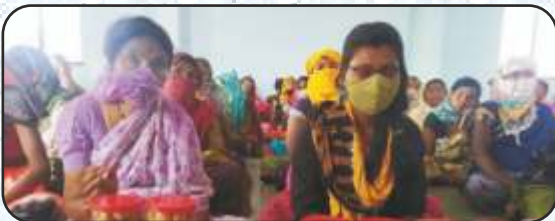
Nnutritious food distribution to SHG Members on 11/3/2021