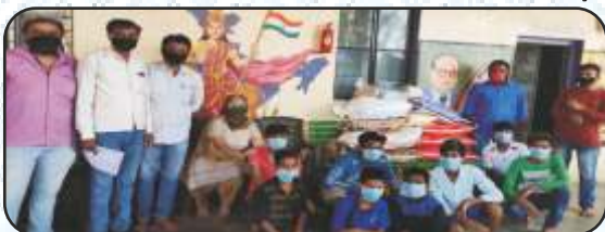
Distribution of Food Grains/Dry Ration and Medical Accessories to Saraswati Ananth Shikshan Ashram Dapodi District Pune 22/05/2020.