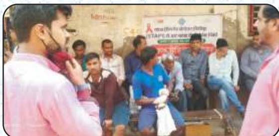
Street Play at Navi Basti, Bhiwandi on 12/11/2021