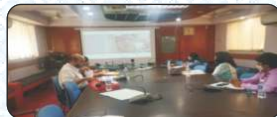
District Level Meeting at Zilla Parishad Thane on 24/3/2021