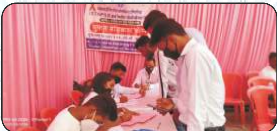
Health Camp at Mega Thale Compound Bhiwandi on 26/01/2021