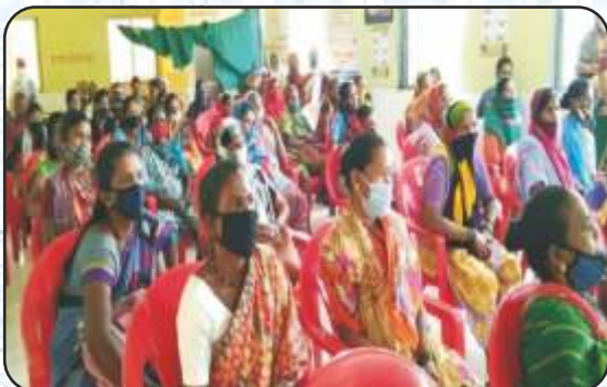
DISHA Kendra Karjat , Block JANSAMVAD at Kadav Primary Health Care Center on 26/3/2021