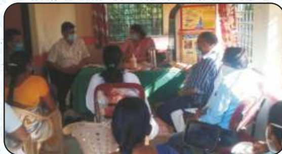
Rugna Kalyan Samiti Meeting at Primary Health Care Center, Vairagad Block Armori District Gadchiroli on 19/3/2021