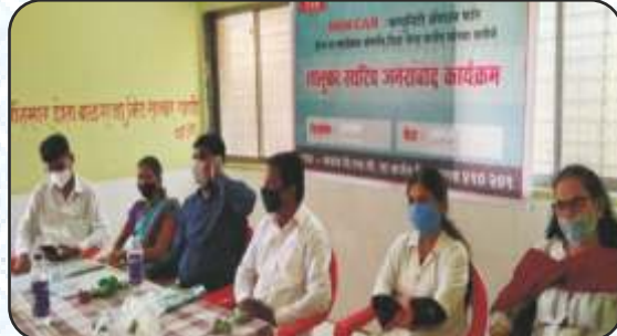
DISHA Kendra Karjat, Block JANSAMVAD at Kadav Primary Health Care Center on 26/3/2021