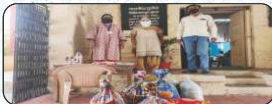
Distribution of Food Grains/Dry Ration and Medical Accessories to Govt. Girls Observation Home Mundhwa Pune on 22/05/2020.