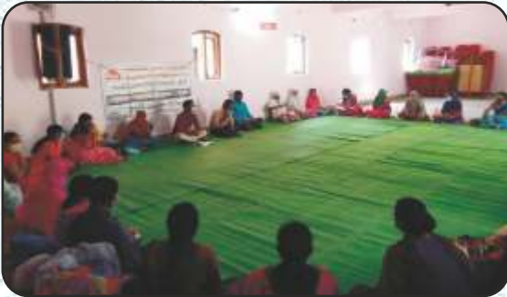
District Level Meeting in action - 15/2/2021 Jagnade Hall, Block and District Chandrapur