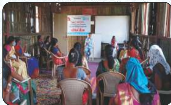
Members of SAKHI Group discussions about CAB Appropriate Behaviour at LOKPANCHAYAT District Ahmednagar on 27/3/2021