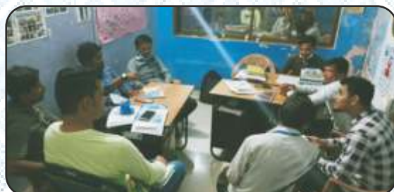
Review meeting at Bhiwandi Office on 02/01/2021