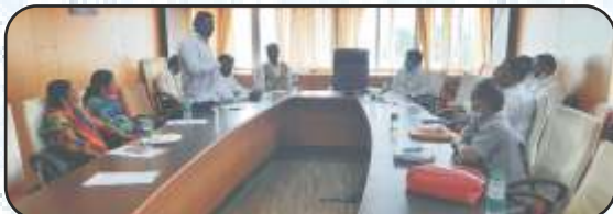
Induction and Orientation Meeting of Community Action For Health (CAH) Project at Zilla Parishad Ahmednagar on 5/2/2021