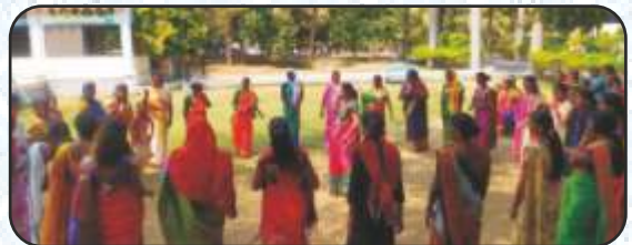
Capacity Building Training of Self Help Groups at Shivtara Krushi Paryatan Kendra village on 15/3/2021