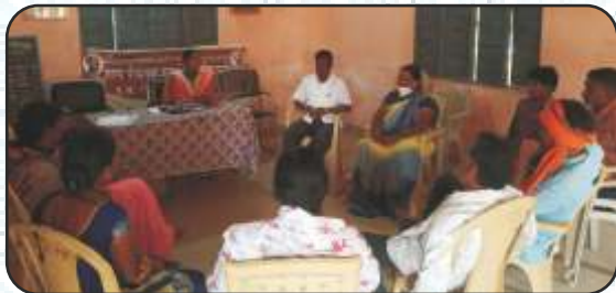
Capacity Building Workshop for District Supervisor and Block Coordinator at Sub Center Kitali, PHC Waddha, Block Armori, District Gadchiroli on 13/02/2021