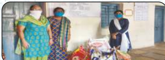
Distribution of Food Grains/Dry Ration and Medical Accessories to Sarvesha Seva Sangh Vadgaon Budruk District Pune on 23/05/2020