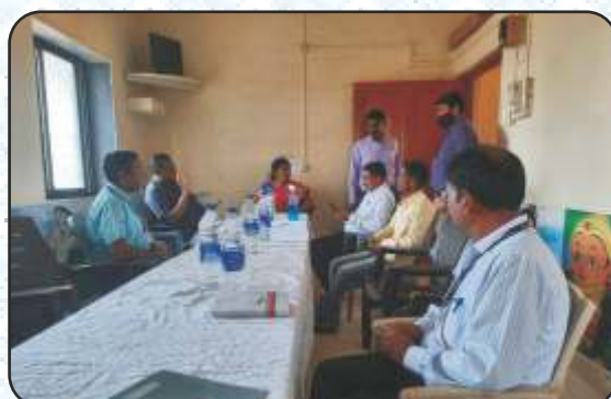
RKS Meeting at Nandgaon PHC Block Jawhar District Palghar on 10/2/2021