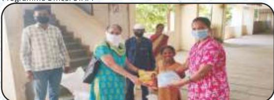
Distribution of Food Grains/Dry Ration and Medical Accessories to Mahila Seva Mandal Kothrud on 23/05/2020