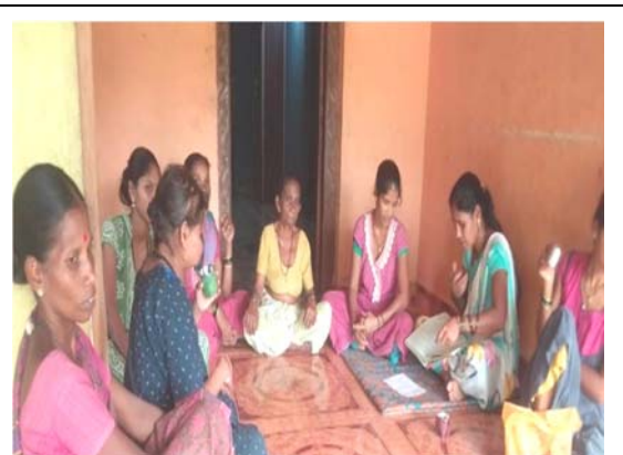
Self Help Group Meeting at Gaikwadpada on 15/10/2022