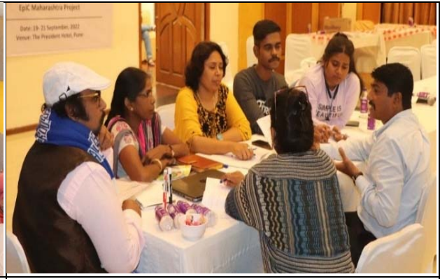
Group Activity under Progress Proposal Development Workshop on 19/9/2022