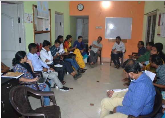
Group Presentations during Resource Mobilization Workshop at Pune on 16/6/2022