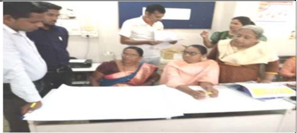
Group Activity under progress Capacity Building of District Partner NGOs held at STAPI Pune during 6-8 February 2023