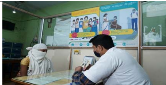
RCCE Material displayed and being used at ART Centres Of Satara, Sangli, Kolhapur and Solapur districts of Maharashtra