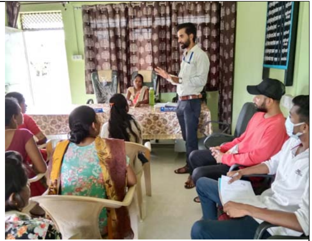
Selection of Village Health Volunteers under progress at Chichapalli PHC on 14/10/2022 Block and District Chandrapur ( Villages Borda, Valani and Ghanta Chouki)