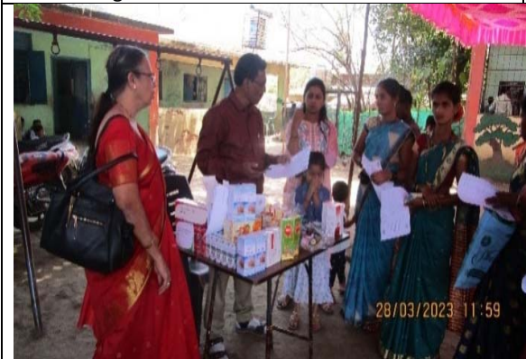
Health Check Up Camp & Medical Consultation on 28/3/2023