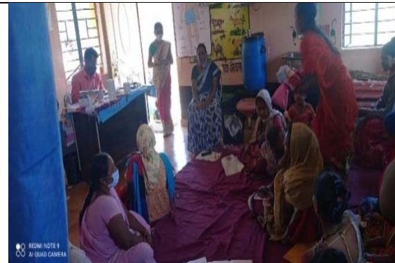
Village Health Sanitation and Nutrition Day (VHSND) at Village Chandgarh Block Kurkheda District Gadchiroli on 1/7/2022