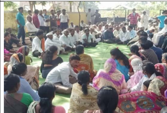
Meeting at Village Chandala Block and District Gadchiroli on 15/6/2022