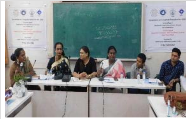
PANNEL DISCUSSION 1: Transgender Protection Act 2019 - Status of Livelihoods Opportunities and Challenges