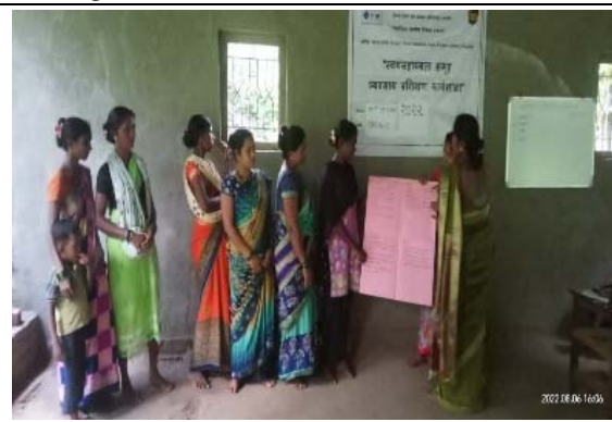
SWOT Analysis presentation by trainee participants entrepreneurship development training of SHG Members 26-28 August 2022