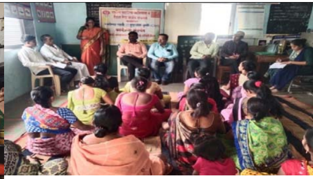
Capacity Building of Jan Arogya Committee Members at Amboli Primary Health Care Centre Block Karjat District Raigad on 16/3/2023