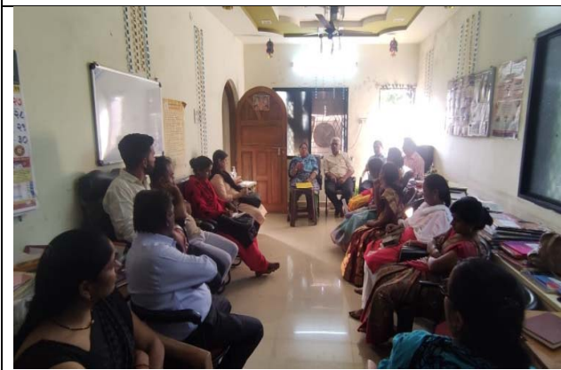
Nagrik Arogya Hakka Manch Meeting at Chandrapur on 26/11/2022