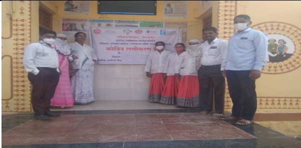
COVID 19 preventive vaccination camp at Village Javale Baleshwar Block Samngamner District Ahmednagar on 23/6/2022