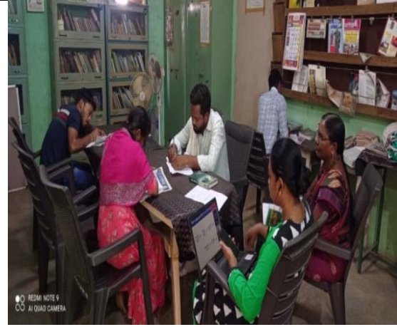
Identification of Village Health Volunteers at Village Belgum Block Kurkheda District Gadchiroli on 24/04/2022