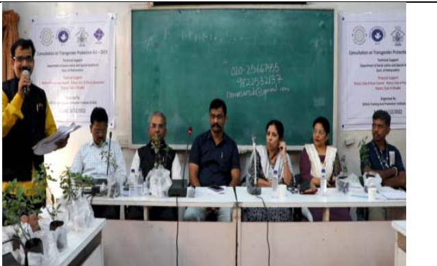
PANNEL DISCUSSION 2: Transgender Protection Act 2019- Suggestions and recommendations regarding livelihoods opportunities