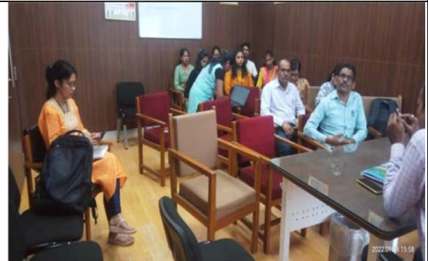
Joint Meetings with representatives of Children Homes(6)/ Special Home(1)/ Orphanages (1); District women and Child Development Officer/District Child Protection officer and Members from Child Welfare Committee Palghar at DWCO office Palghar on 08/9/2022