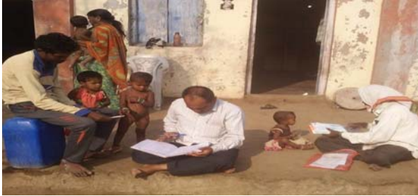
COVID 19 Vaccination Survey at Village Kouthe Malkapur Block Samngamner District Ahmednagar on 22/6/2022