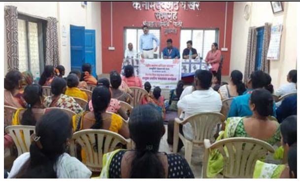
Sudhagadpali Block JANSAMVAD District Raigad on 28/3/2023