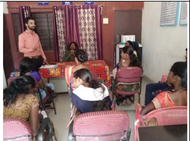
The selection of Village Health Volunteers under progress at Ghuggus PHC Grampanchayat Anturla on 26/12/2022 Block and District Chandrapur