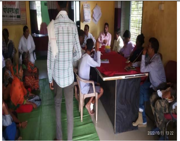
Gram Sabha at Gram Panchayat Maroda on 11/10/2022 Block and District Gadchiroli