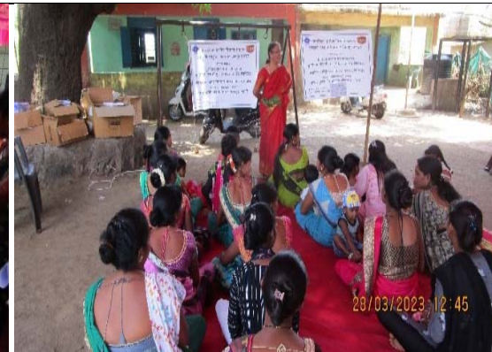
Meeting with SHG Members at Village Suksale on 28/3/2023