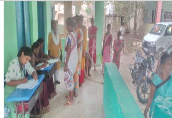
Health Check Up Camp and Medical Consultation on 12/5/2022