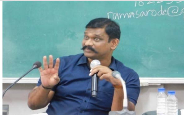
Shri Ravindra Kadam Patil, Deputy Commissioner Social Welfare Govt of Maharashtra during the panel discussions