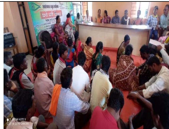
Gram Sabha at Village Shivani Block Kurkheda District Gadchiroli on 19/7/2022