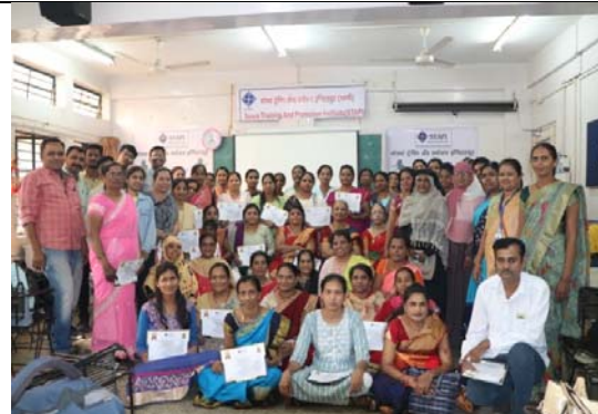
Exchange of Experience Meeting with Beneficiaries under Project Phoenix at STAPI Pune on 10/3/2023