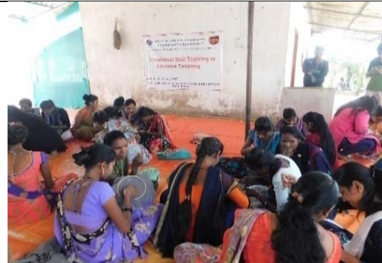
20 February - 4 March 2023 Basic Tailoring Course in progress Block Vikram Gad District Palghar