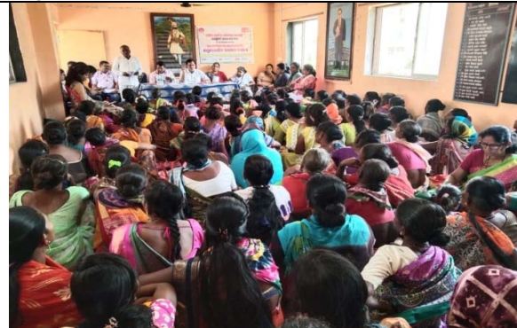
Karjat Block JANSAMVAD District Raigad on 27/3/2023