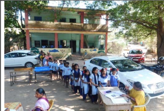
Health Checkup Camp and Medical Consultation at Village Suksale on 20/01/2023 Block Vikram Gad District Palghar