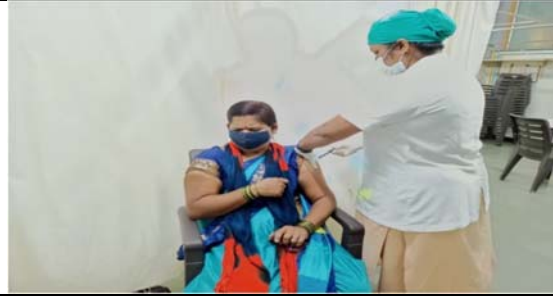
COVID-19 preventive vaccination Camp at Miraj District Hospital, Sangli on 12/5/2022