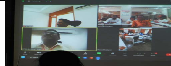
Dr. Eknath Male Deputy Director - Health Services Government of Maharashtra during virtual session on involvement of district partner NGOs in handling communicable and non communicable disease at village level on 7/2/2023