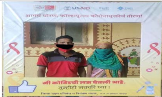
COVID-19 preventive vaccination Camp at Savitribai Phule Hospital, Kolhapur on 23/05/2022