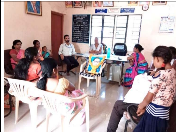
The selection of Village Health Volunteers under progress at Ghuggus PHC Grampanchayat at Matardevi on 6/12/2022 Block and District Chandrapur