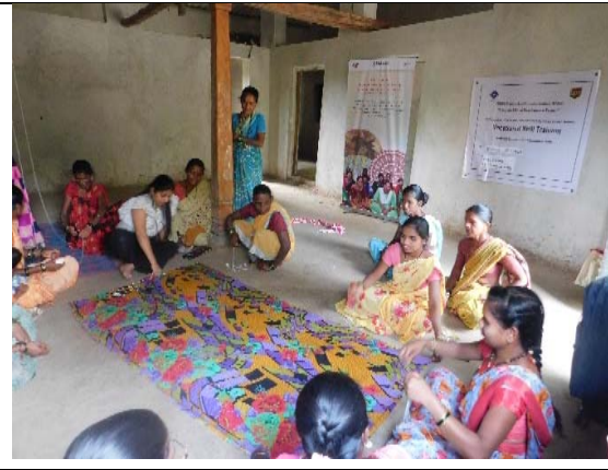
Tailoring and Quilt making batch - 5-12 January 2023