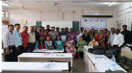
Risk Communication and Community Engagement (RCCE) Materials Development Workshop held during 25-26 April 2022 at Pune