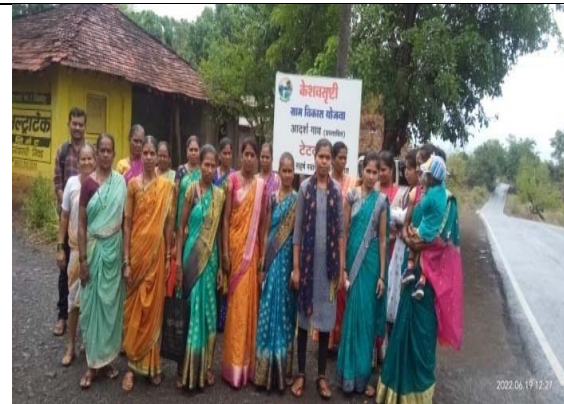
Exposure Visit of Self Help Groups at Keshav shrushti Bamboo Art Center Tetwali Block Vikram Gad District Palghar on 19/6/2022