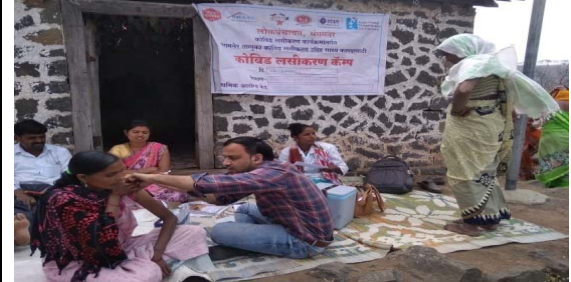
COVID 19 preventive vaccination camp at Village Pimpalgaon Matha Block Samngamner District Ahmednagar on 23/6/2022