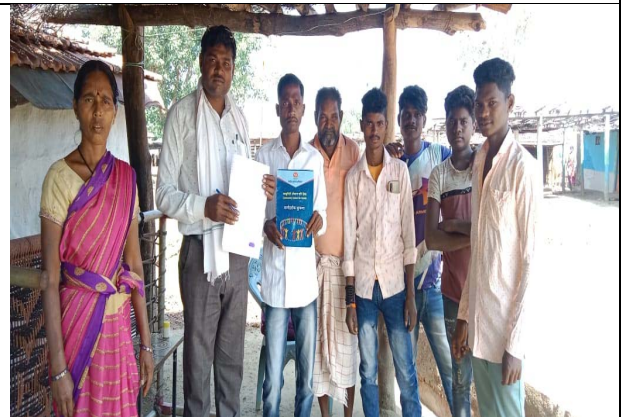
Awareness Meetings in Khadki, Raipur, Kakban Villages of Jivati Block District Chandrapur on 8/11/2022