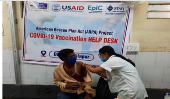
COVID-19 Preventive Vaccination at ART Centre through Help Desk in August 2022