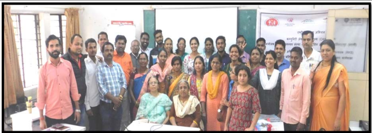
Group Photo District Project Partner NGOs Capacity Building Training held at STAPI Pune during 6-8 February 2023