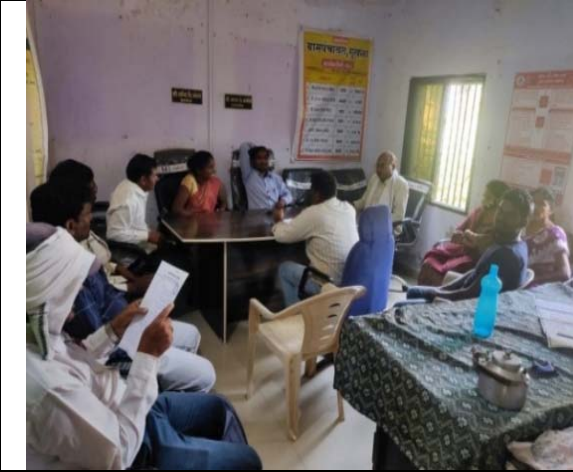
Meeting at Gram Panchayat Gurwala Block and District Gadchiroli on 20/4/2022 Seen in the Photograph :- District Coordinator CAH Project Amhi Amchya Arogyasathi, Village Health Volunteers, Sarpanch and local residents