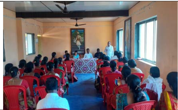
Capacity Building of Village Health Sanitation and Nutrition Committee Members at Kadav Primary Health Care Centre Block Karjat District Raigad on 18/1/2023