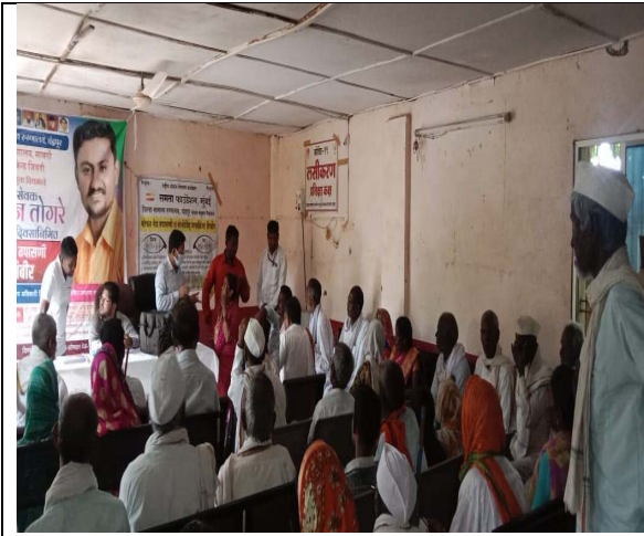
Eye Check Up and Cataract Surgery Camp Block Jivati District Chandrapur on 10/10/2022