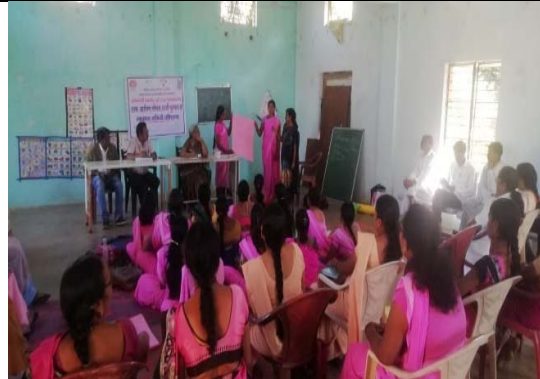
Training of VHSNC Members at Amirza PHC Block and District Gadchiroli on 10/2/2023