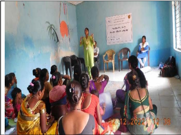
SHG Entrepreneurship Development Training 22-24 December 2022 Block Vikramgad District Palghar