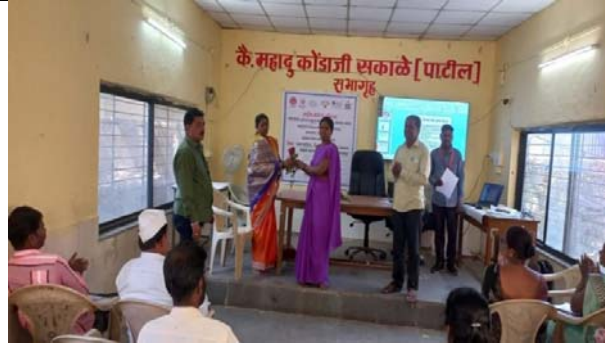
Training of VHSNC Members Block Trimbakeshwar District Nashik on 27/2/2023