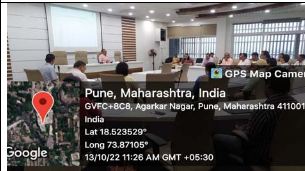
Review Meeting with the Chief Executive Officer Pune Zilla Parishad at Zilla Pune - Implementing Support Agency -ISA Block Shirur District Pune on 13/10/2022